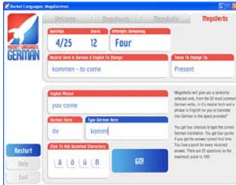
Screen shot of Rocket German verb learning game.

The verb practice game differs from the other two in that it involves writing in the target language. Users are given a verb from a database of 50 of the most common verbs in the target language, and also a tense to change the verb into. They type the conjugated verb into the answer field.